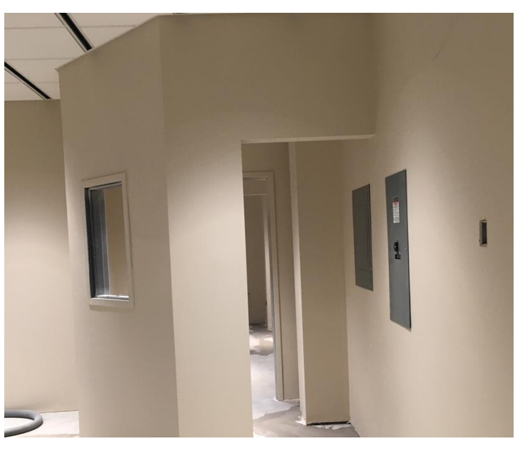
The new control room connects the Fluoro room with the X Ray room!