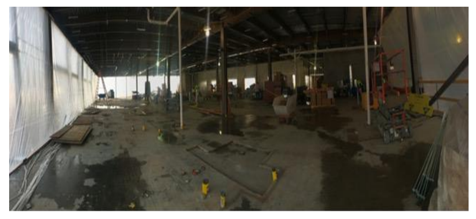
The overall view of the upper level portion of the new addition. The cut out shape in the floor towards the middle of the picture outlines where the bathrooms will be in each of the rooms. Soon walls will be added around each area to help define the space.