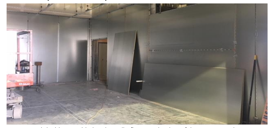
A special shielding is added to the walls, floors, and ceiling of the MRI room! This stops the magnetic force from traveling beyond the walls of that specific room.