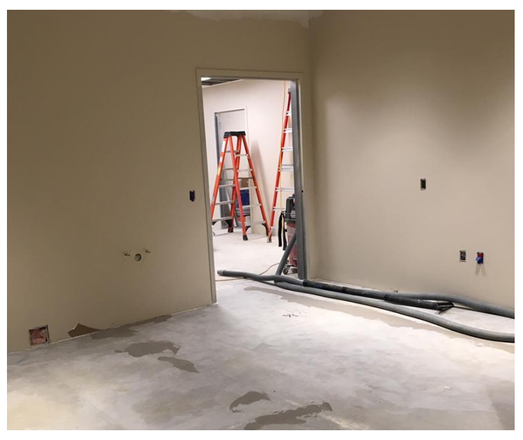
Floor prep is involved in each room before the actual flooring materials can be placed down. This helps ensure a flat floor.