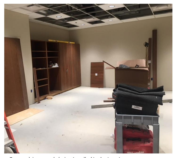
Casework is currently being installed in the Imaging area.