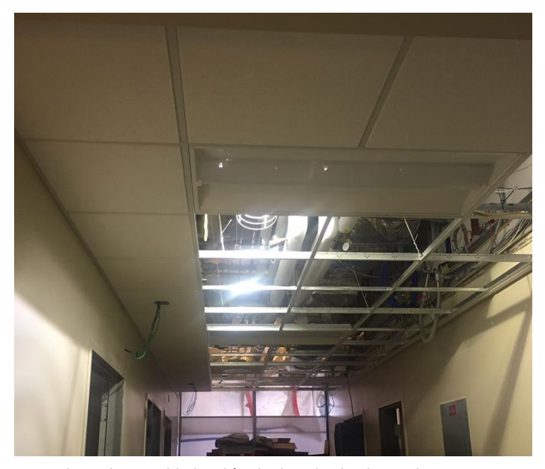
A ceiling is being added and finished up that leads into the new "Main Street" area at the end of the corridor.