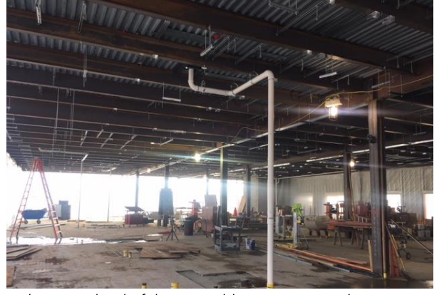
The upper level of the new addition is coming along quickly. Soon this area will be fireproofed.