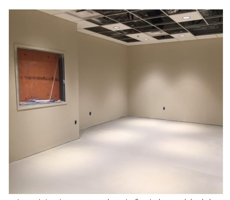
In certain Imaging area rooms, the entire floor in the room Is leveled to prepare for the new equipment being installed.